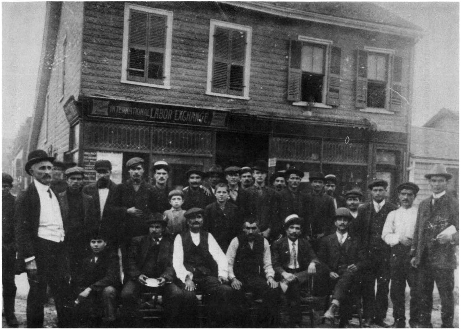
Macedonian men gathered near the Baptist Mission Labour Agency, begun to protect immigrant workers from exploitation, c. 1912. (Women's Baptist Mission).